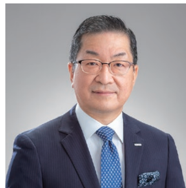
POKKA SAPPORO FOOD & BEVERAGE LTD. President and CEO

We sincerely appreciate your continued support.